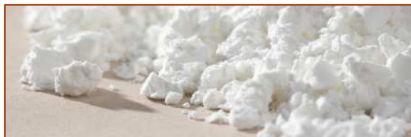
Figure 1. Powdered food products often experience caking/lumping issues during processing and handling

which can be defined as the process by which free flowing materials are transformed into lumps and agglomerates due to changes in atmospheric conditions or process temperatures. There are several reasons why