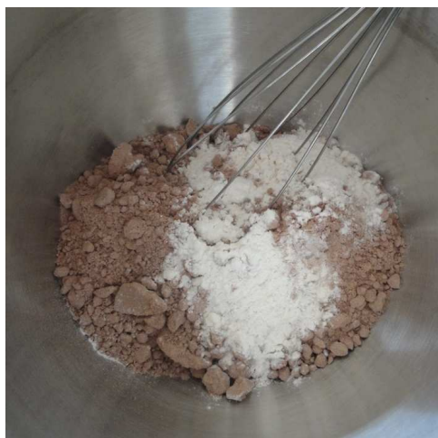
Figure 3. Glass transition is frequently the cause of lumps in final food products

Glass transition effects. Glass transition occurs in bulk materials when increasing surface moisture induces a lowering of the glass transition temperature of the solid material, changing a hard crystalline phase into an amorphous plastic phase where particles are cemented together by plastic creep. Basically, the moisture creates a soft material and the stresses between particles press adjacent particles together, causing them to bind to each other, resulting in a solid mass. A subsequent change in moisture content raises the glass transition temperature, solidifying the amorphous mass. Many foods and nutraceutical products are subject to this mechanism as they experience variations in temperature and moisture exposure during processing and storage. When a customer opens a box of cake mix, for example, and needs to use a knife or fork to pry clumped mix from the corners of the box – glass transition has occurred in storage as a result of moisture ingress during handling and packaging.