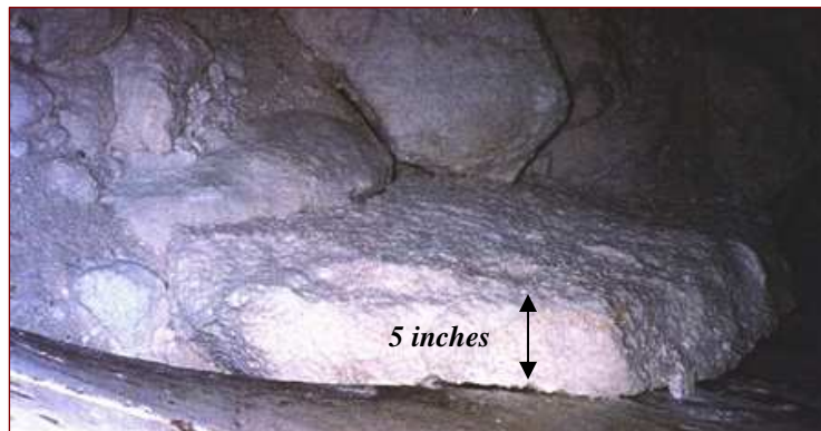
Figure 2. Moisture ingress causes material caking in processing equipment

Crystal growth between particles. Caking often results as bulk materials pick up moisture during storage. Severe caking can result in the solidification of the entire mass within a silo. Moreover, consumer products such as food powders can cake during storage both prior to purchase and after initial use. Hence, the problems of handling such products are often passed on to the consumers – which most customers find unacceptable. Materials can develop high strength due to crystal growth between particles in moist environments after heat is added either in processing or as a natural result of storage. Crystallization occurs when increasing surface moisture dissolves a portion of the surface materials. Liquid bridges then form between particle contacts where a subsequent change in moisture content evaporates the liquid binder leaving crystal bridges between particles. Drink mixes and other products with high sugar or salt contents are particularly susceptible to this crystallization caking issue.