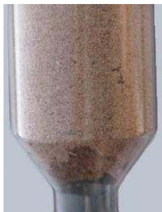
Figure 2. Material arch in a funnel-flow hopper

Permeability is the superficial velocity of gas or fluid passing through the bulk material when the pressure drop across the bulk material equals the weight density of the bulk. It can be thought of as an incipient fluidization velocity, except that it is measured as a function of the stress applied to the bulk material. However, the value of the permeability extrapolated to zero stress is identically equal to the incipient fluidization velocity. Permeability data is used to determine the pressure drops in packed bed operation. It is also used to determine the limiting flow rates where the resistance to gas flow is the key limiting factor to solids flow.